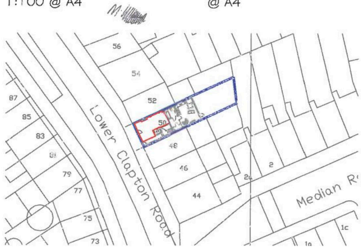
site plan 1:500